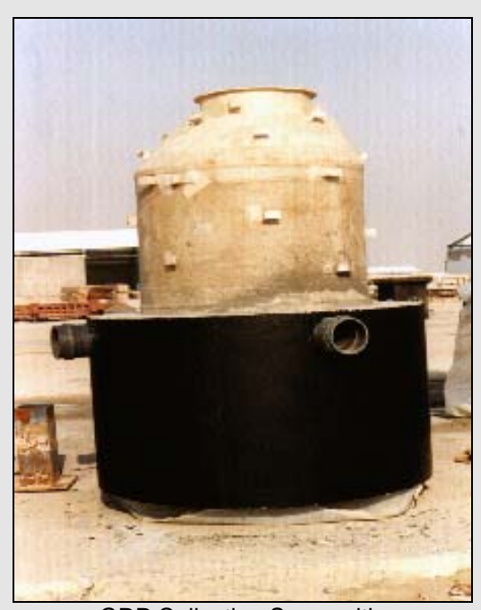
GRP Collection Sump with concrete anti-floatation collar